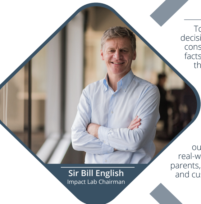
Sir Bill English Impact Lab Chairman

Alongside expertise in data-driven decision making, our team brings a wealth of real-world experience. We are parents, teachers, volunteers and customers of social services.